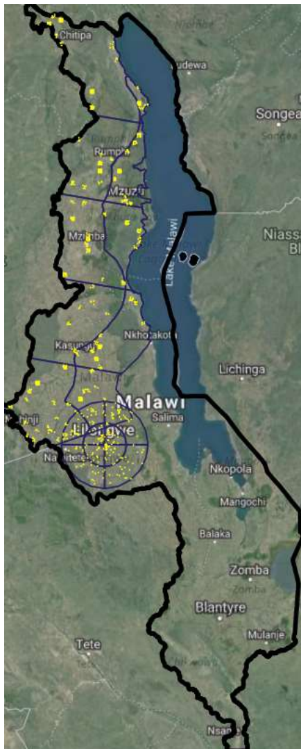
Figure 1. Sampling in 2019 Malawi LGPI