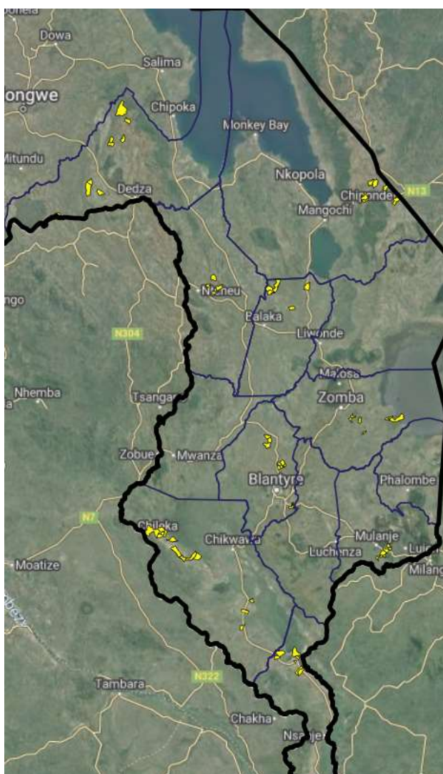
Figure 2. Sampling in Malawi 2016 LGPI Used in Covid-19 Study

Enumerators were instructed to enter sampling units using tablets to track their locations and confirm they were in the correct area. They were asked to go to the center of each hectare and then move outward, in separate directions. Within each household, one participant was randomly selected using the Kish method.